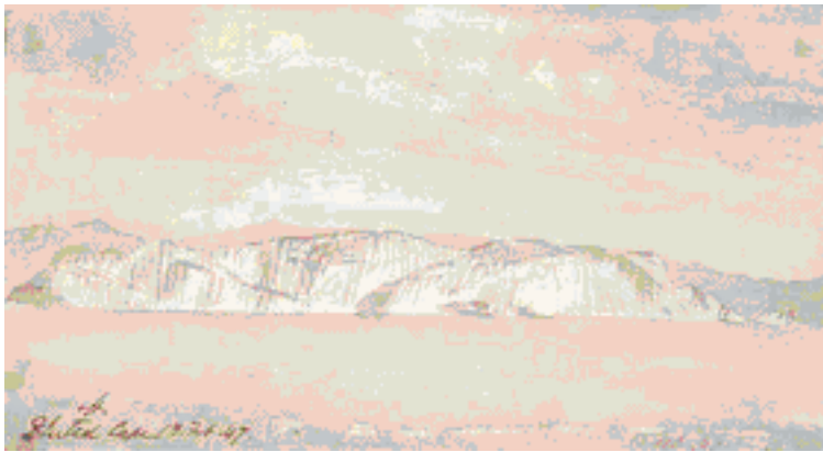
C J La Trobe (not signed) Off Fluted Cape, February 1847