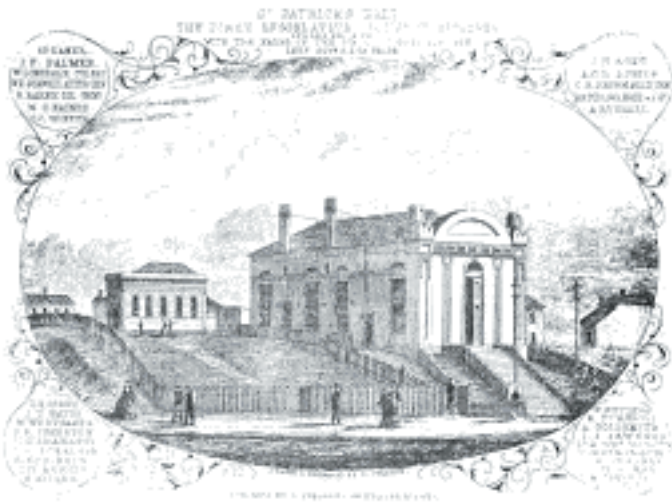
St Patrick's Hall, the First Legislative House in Victoria, 1852.