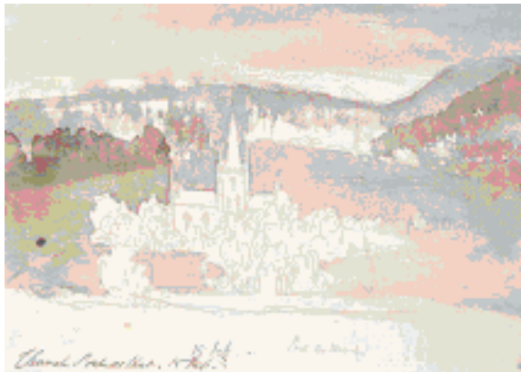
C J La Trobe (not signed) Church at Port Arthur, February 1847

La Trobe declined his request, citing Rules and Regulations for Her Majesty's Colonial Service, 1843 , namely 'that they must not be drawn without the previous sanction of the Secretary of State.' Sir John obtained advice from various legal officers that it had surely