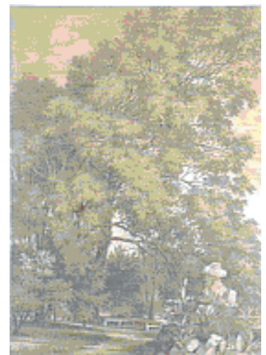
Edward La Trobe Bateman, View from the Rockery